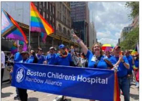
Boston Pride Parade 2023.

completed online via Eventbrite, where interested parties will reserve their place in the parade and/or space at the festivals. Registration fees and payment options are outlined at https://www.bostonprideforthepeople.org/