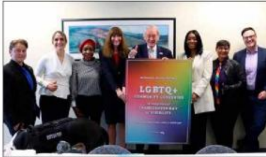
see MARKEY , page 2

Amid the state of emergency that transgender and nonbinary people in Massachusetts and across the United States are experiencing - including increasing reports of violence,