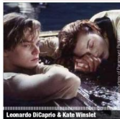
Leonardo DiCaprio & Kate Winslet