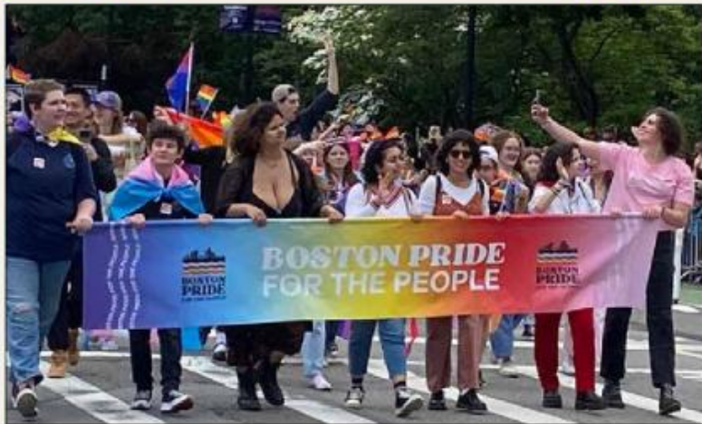
Boston Pride Parade 2023.