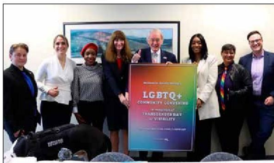
see MARKEY , page 2

Amid the state of emergency that transgender and nonbinary people in Massachusetts and across the United States are experiencing – including increasing reports of violence,