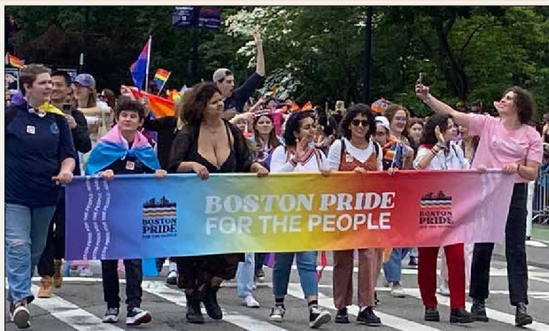
Boston Pride Parade 2023.