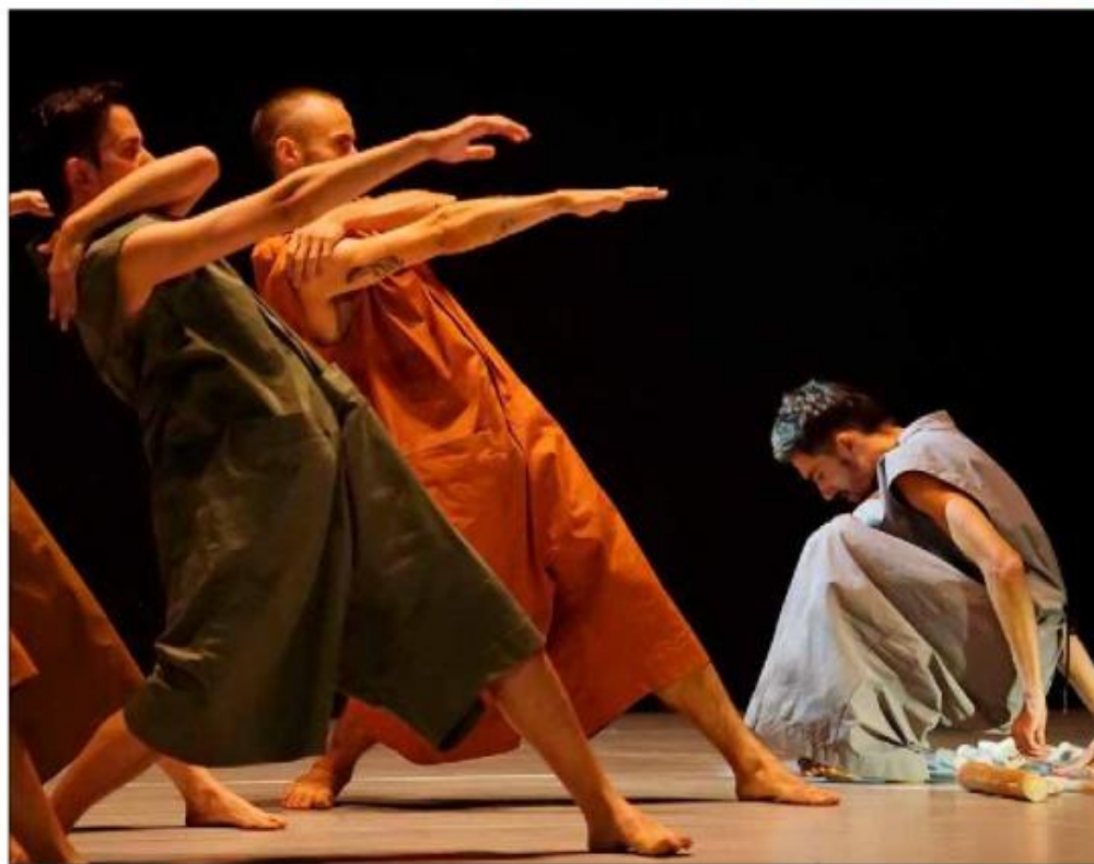
Vertigo Dance Company members in “MAKOM”—a Celebrity Series offering to be staged at Shubert Theatre.

“It’s a bridge they (the dancers) are building through the show,” Noa explained. Sometimes there will be a circle representing community. “We have to support each other and be together. We should be one,” she continued. “The circle can be like a folk dance,” she added. At other moments, dance movement will suggest a Shevil—Hebrew for ‘path.’ That path may connect with the creation of “a bridge connecting between two different peoples.” Some moves