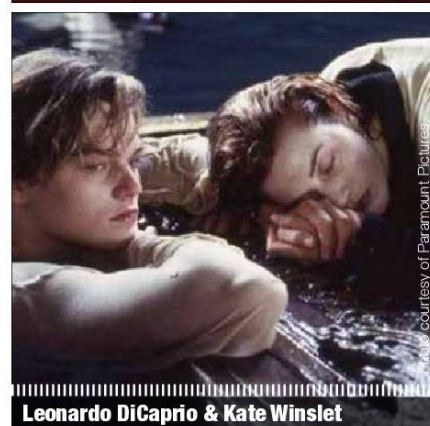
Leonardo DiCaprio & Kate Winslet