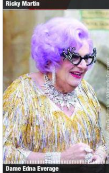
Dame Edna Everage