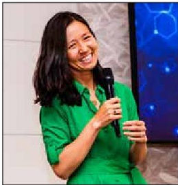
Mayor Michelle Wu.