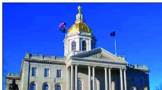
The New Hampshire Statehouse, photo by Alexis Horatius, via Wikimedia Commons.