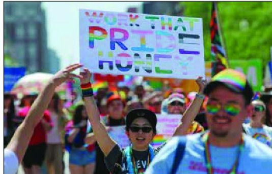
Boston Pride 2019.