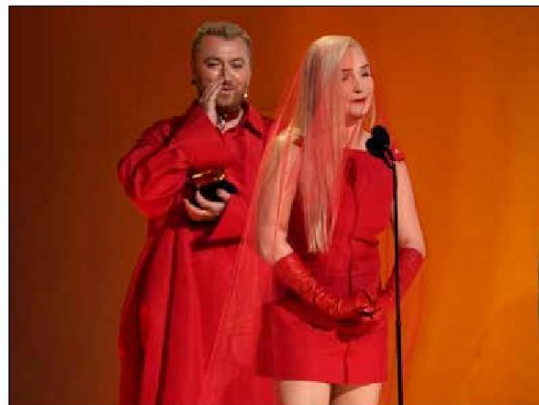
Kim Petras, right, and Sam Smith accept the award for best pop duo/group performance for "Unholy" at the 65th annual Grammy Awards on Sunday, Feb. 5, 2023, in Los Angeles.