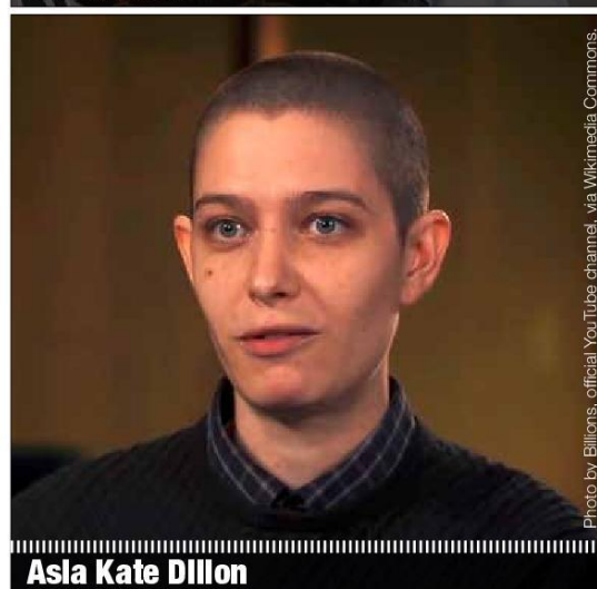
Asia Kate Dillon