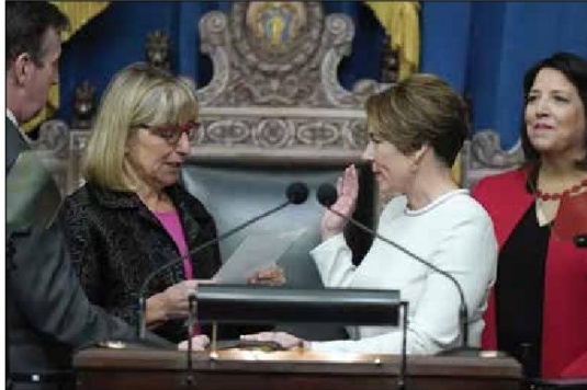
Maura Healey, center right, is sworn in as Massachusetts governor by state Senate President Karen Spilka, left, as Kim Driscoll, right, looks on during inauguration ceremonies, Thursday, Jan. 5, 2023, at the Statehouse, in Boston.