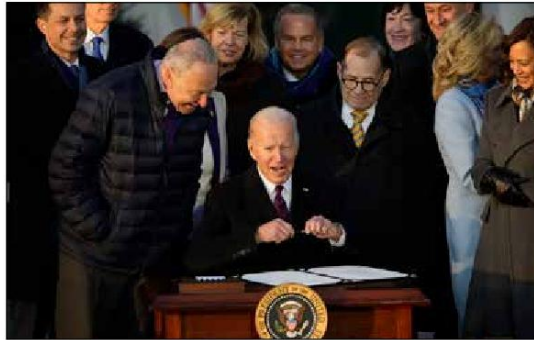
President Joe Biden signs the Respect for Marriage Act, Tuesday, Dec. 13, 2022, on the South Lawn of the White House in Washington.

"I got in trouble," Biden joked of that moment. Three days later, Obama him-