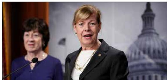
Sen. Tammy Baldwin, D-Wis., joined at left by Sen. Susan Collins, R-Maine, speaks to reporters following Senate passage of the Respect for Marriage Act, at the Capitol in Washington, Tuesday, Nov. 29, 2022.