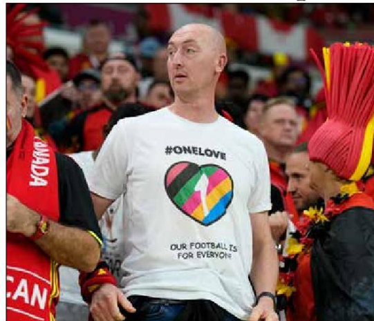
Germany's supporter wearing a rainbow jersey waits for the World Cup group F soccer match between Belgium and Canada, at the Ahmad Bin Ali Stadium in Doha, Qatar, Wednesday, Nov. 23, 2022.