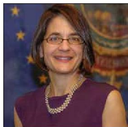
State Senator Becca Balint (D).