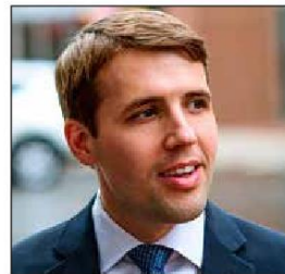
New Hampshire Congressman Chris Pappas (D).

Meanwhile, in Colorado, Polis appears poised to win his second term as governor, with polls showing him with an 18-point lead or higher over his Republican challenger.