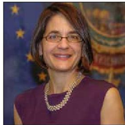
State Senator Becca Balint (D).

Balint, 54, president of the Vermont Senate and a former teacher, faces Republican Liam Madden, a 38-year-old Marine Corps veteran and antiwar activist, who describes himself as an independent, and who does not have the backing of the state