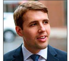
New Hampshire Congressman Chris Pappas (D).

Meanwhile, in Colorado, Polis appears poised to win his second term as governor, with polls showing him with an 18-point lead or higher over his Republican challenger.