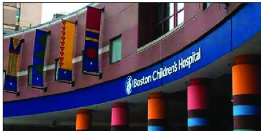
see BCH , page 7

BOSTON (AP)—Federal authorities on Thursday arrested a woman accused of calling in a fake bomb threat at Boston Children's Hospital amid a barrage of harassment and threats of violence over its surgical program for transgender youths.