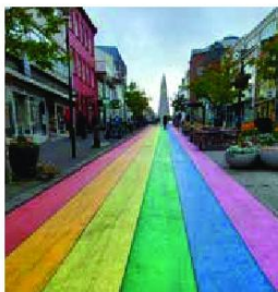
Photo of Regnbogagatan (Rainbow Street) in Reykjavik, Iceland.

by Dana Rudolph | drudolph@mombian.com contributing writer