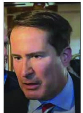
Congressman Seth Moulton.

MassEquality challenged Moulton's terminology in a state-