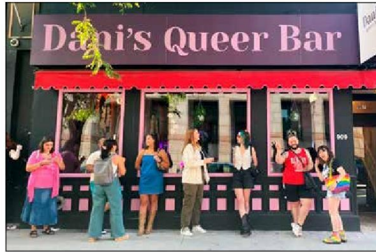
Patrons standing outside the grand opening of Dani’s Queer Bar at 909 Boylston St. in Boston on Thursday, Sept. 12, 2024.