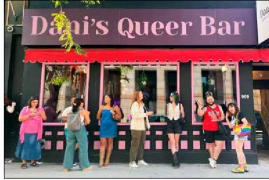
Patrons standing outside the grand opening of Dani's Queer Bar at 909 Boylston St. in Boston on Thursday, Sept. 12, 2024.