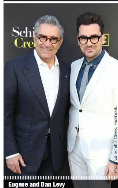
Eugene and Dan Levy