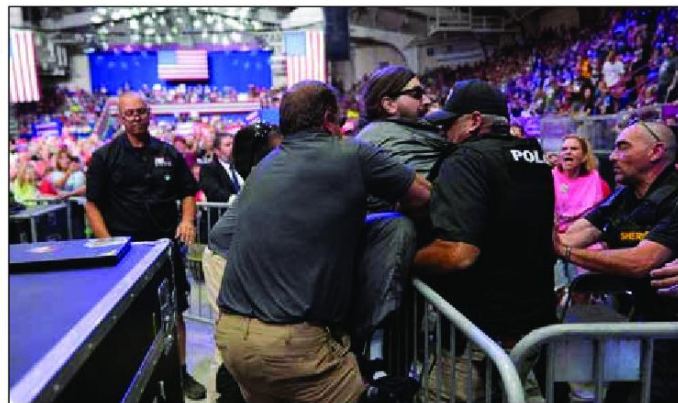
Police remove a man, center with sunglasses, who had climbed onto the media riser, as Republican presidential nominee former President Donald Trump speaks at a campaign event, Friday, Aug. 30, 2024, in Johnstown, Pa.

The Associated Press receives support from several private foundations to enhance its explanatory coverage of elections and democracy. See more about AP's democracy initiative here. The AP is solely responsible for all content.