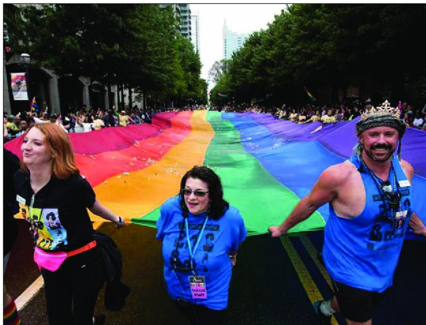
A massive rainbow flag is carried through the city's Midtown district during the annual Gay Pride Parade in Atlanta, Ga., Oct. 13, 2019.